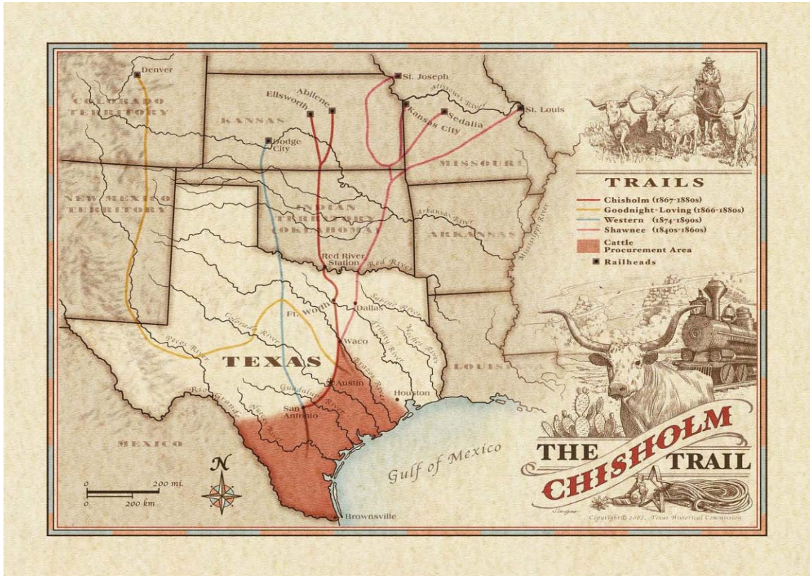
Attachment 1