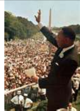
He gave his "I Have a Dream" speech in Washington, D.C. before 250,000 people.