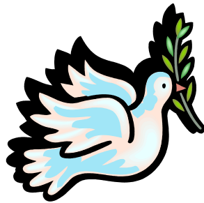
He led peaceful protests against the unfair treatment of African Americans.