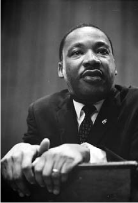
Dr. Martin Luther King, Jr.

(Note: A set of cards should contain 2 copies of each card.)