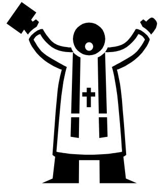
He became a minister.